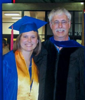
Class of 2010

"I recommend HutchCC to anyone starting their career path – especially any student looking at a science based career."